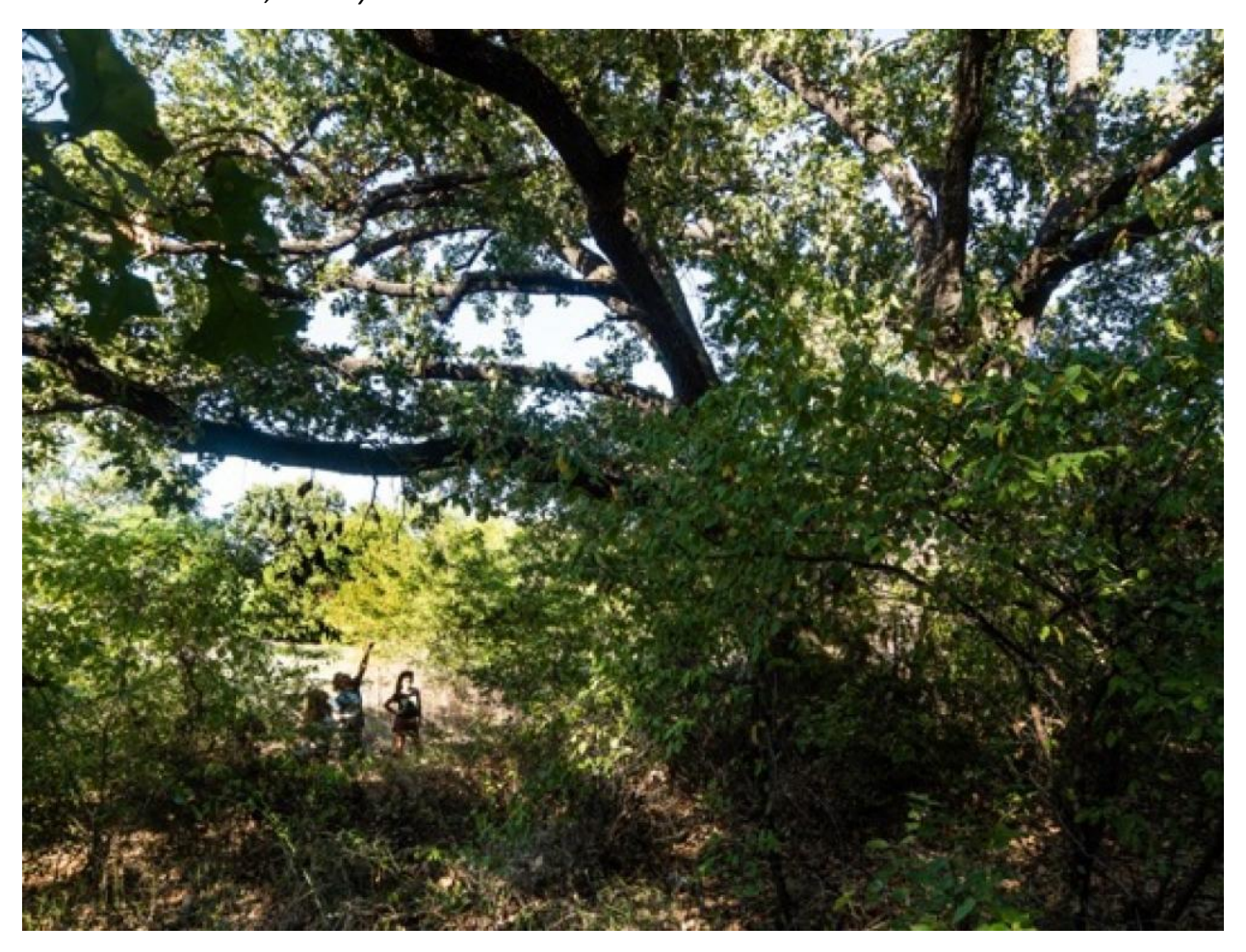
The "Old Caddo Oak" was officially proclaimed a historic tree at Southwest Nature Preserve on Saturday.